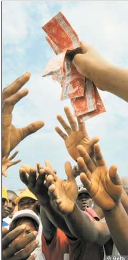
Outreach work: condoms on offer in Abidjan, Ivory Coast. The World Bank, which let family planning fall to 2 per cent of its health budgets, is preparing a new strategy for Africa

Even in countries with a currently high proportion of young people such as China and India – let alone more developed ones including Italy, Russia and Japan that are already feeling the impact of a predominantly older