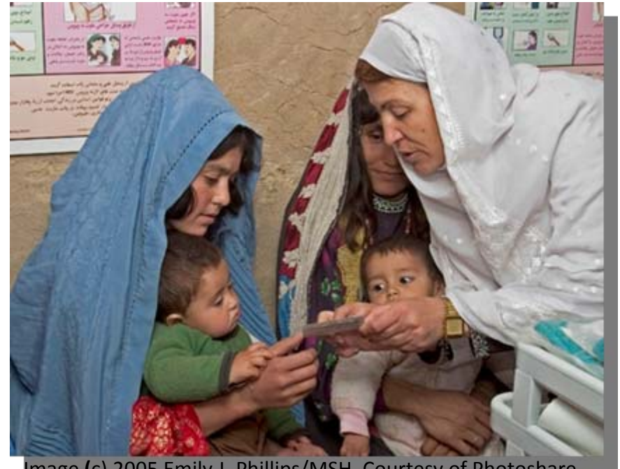
A 14-year-old Afghan mother receives contraceptive pills and family planning education during a visit to her midwife.

Essential for developing funding “asks” used in advocacy