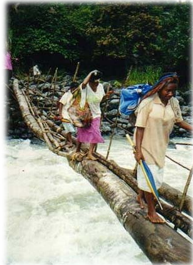
Image: (c) 2002 Kingston Namun/Mark Munguas, Courtesy of Photoshare. Volunteers help community-based nurses carry backpacks and contraceptive bags over a rushing river in Papua new Guinea.